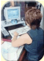
Insurance claims department