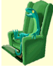
In-office waiting is minimal