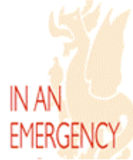
Emergencies seen same day.