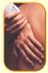
The doctor has over 15 years experience