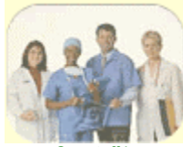
Our staff is supportive, knowledgeable, and caring