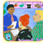
We offer informative, free health classes

Print this page for a discount of $57.00 on your first visit, including x-rays.