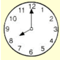
Office opens at 8:00 am