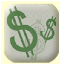
Click here to this page!

Print this page for a discount of $57.00 on your first visit, including x-rays.