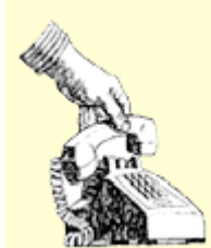
Appointments are not necessary for established patients