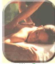
We offer personalized one-on-one care